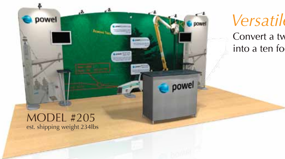
MODEL #205 est. shipping weight 234lbs