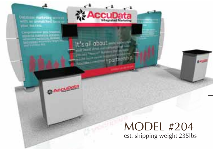
MODEL #204 est. shipping weight 235lbs