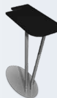
Backwall Counters Attach Securely to Tube Frame