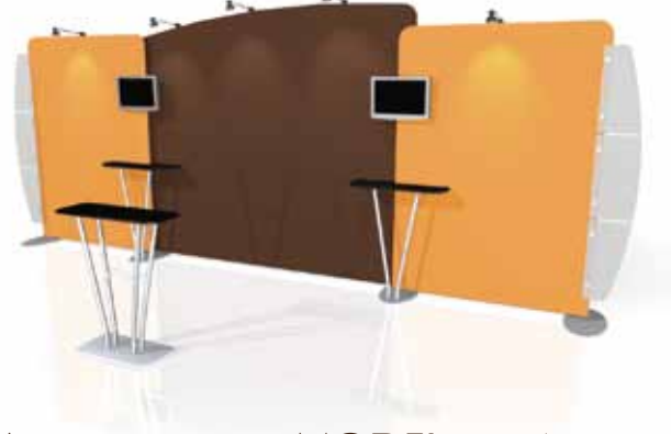
MODEL #208 est. shipping weight 165lbs