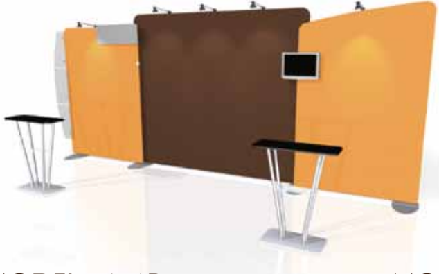
MODEL #206 est. shipping weight 142lbs