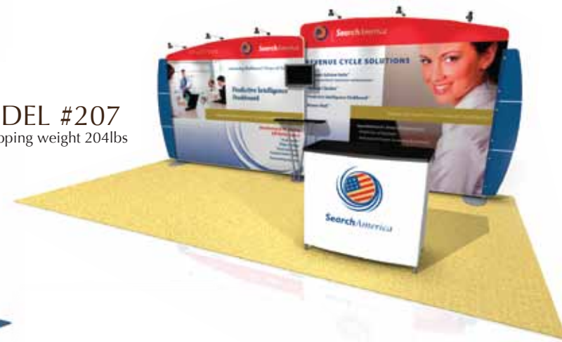
MODEL #207 est. shipping weight 204lbs