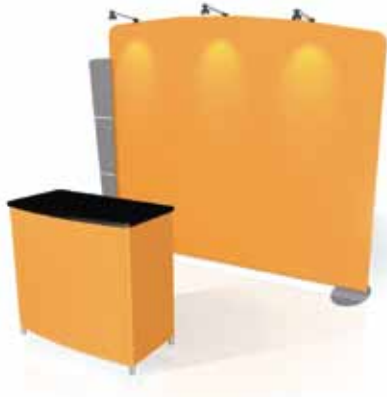
MODEL #101B est. shipping weight 124lbs