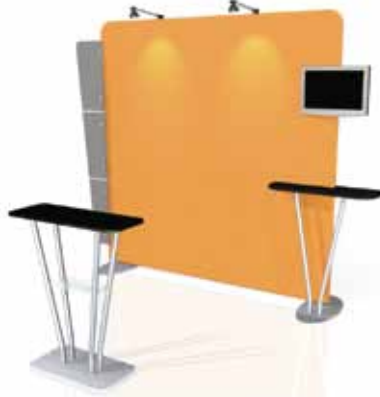
MODEL #102A est. shipping weight 71lbs